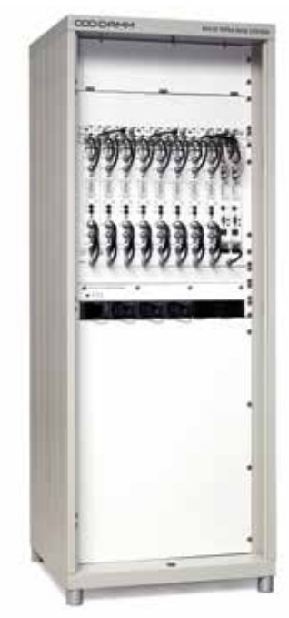
TetraFlex High Capacity Indoor Base Station

The TetraFlex system has been optimized for installation within rail and metro operations. The TetraFlex IP65 encapsulated outdoor base station is well suited for installations in harsh environments, including metal dust and high humidity, which are often the case in metro tunnels. The system's compact design makes it ideal for installation in narrow metro tunnels. It can also be mounted outdoors directly on buildings or masts alongside the railway or in stations. The system can be installed using any combination of outdoor base stations and high-capacity indoor base stations, as required.