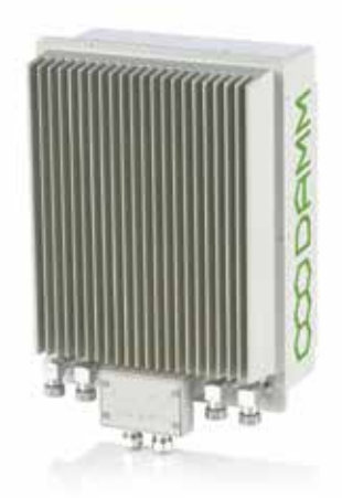
TetraFlex outdoor base station.

DAMM's TetraFlex Solution provides a reliable and complete trunked TETRA communications system, enabling private and secure voice and data communications across all activities in rail and metro operations for increased efficiency and optimized safety.