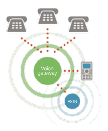
TetraFlex Voice Gateway

With the TetraFlex Communications System used in rail and metro, user-defined groups and staff teams can easily be defined and coordinated. The highly flexible voice communication services support individual private calls, group calls, telephony communications (PSTN) and more; always with crystal-clear voice quality, even in the noisiest areas. For emergency incidents, the system provides emergency calls, man-down facilities and override functions.