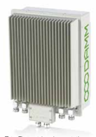
TetraFlex outdoor base station.

By supporting remote connection, the TetraFlex Network Management system provides easy access to configuration and surveillance of the entire network and all subscribers. It comes with a Google map, where the alarm status of all site positions is monitored.